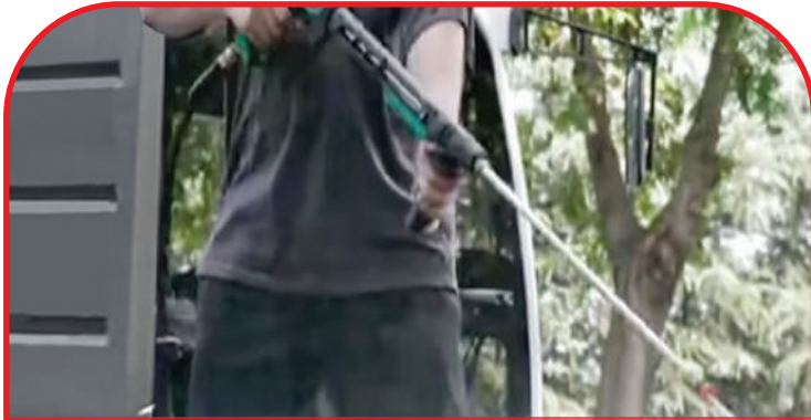
High Pressure Water Gun

From precision brushing to high-power vacuuming – every detail of DTMS-6000 EV is built for next-level street cleaning.