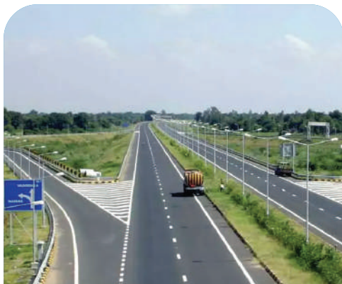
Roads & Highways

The DTMS-6000 EV battery-operated sweeper is designed for heavy-duty cleaning in various public and industrial spaces. It ensures efficient dust and debris removal, making it ideal for: